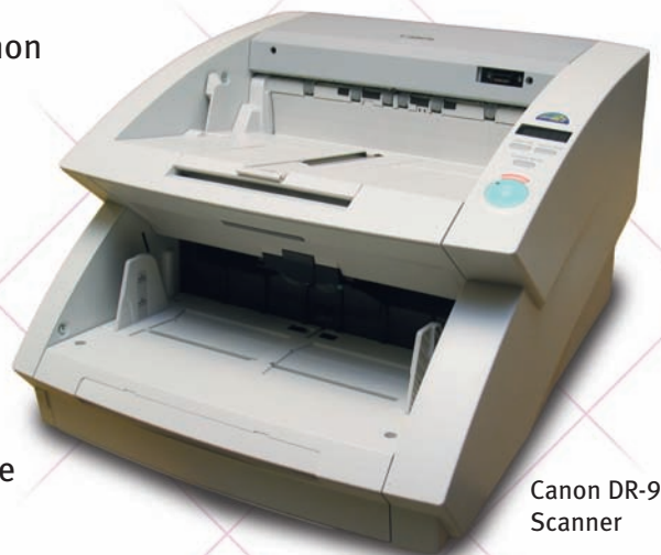
Canon DR-9080C Scanner

“The project took 8 months to complete, with the Canon scanners operating for 12 to 14 hours per day,” said Mr. Roberts. “We averaged over 50,000 pages daily, pushing the devices far beyond their rated specification and never once needing a major repair. The only downtime we experienced was performing regular preventive maintenance, such as replacing feed rollers, which the operators could handle themselves in minutes. Even after the incredible amount of volume, the machines continue to work perfectly even though you can see paper tracks on the metal where it has been worn down over time.”